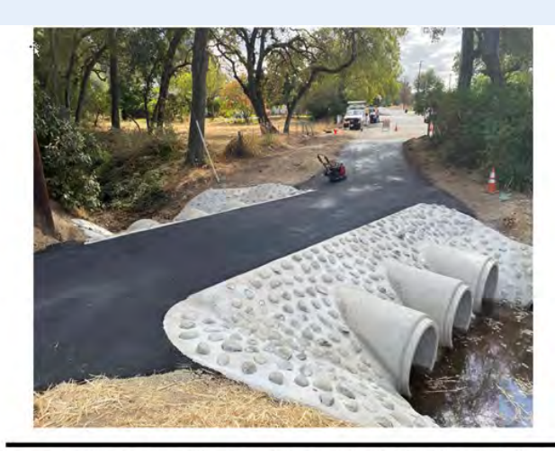
Hackberry Ln. pedestrian crossing, successfully completed through a joint effort between DOT and DWR 7