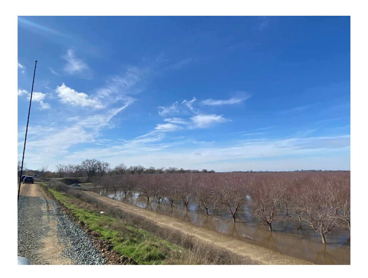
Figure 3 - As we pursue relief, recovery, and future sustainable adaptation, it will take a Herculean effort and close coordination between many jurisdictions and authorities to prevent more flooding in the future.

While I am encouraged by the many levels of government that have come together to aid in recovery and find solutions, there is no denying that the recovery process will be difficult and extensive. As we pursue relief, recovery, and future sustainable adaptation, it will take a Herculean effort and close coordination between many jurisdictions and authorities to prevent more flooding in the future.