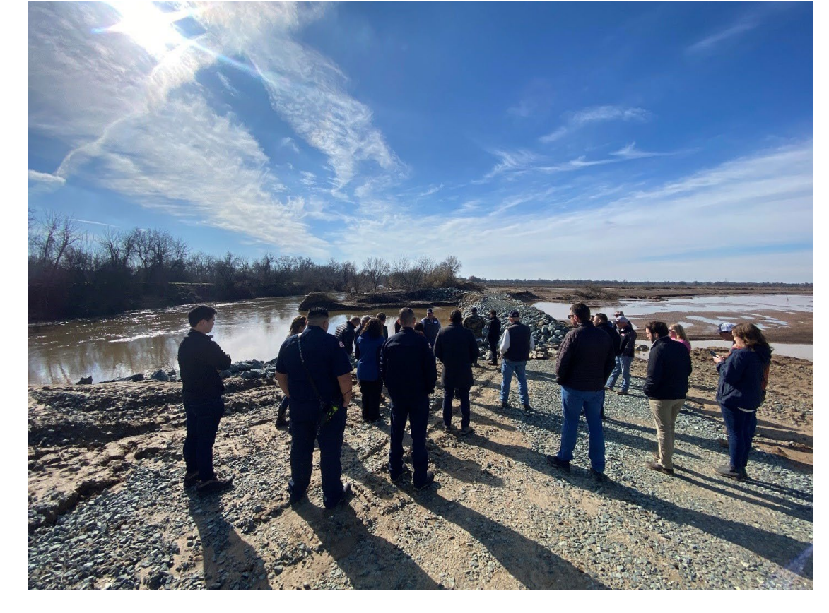
Figure 2- Surveying this destruction was an incredibly sobering experience and a painful reminder of the sheer magnitude of these recent storms.

As we moved into the New Year, a Flash Flood Warning went into effect, a levee breached near Wilton, and residents of south Sacramento County needed to evacuate before roads became impassable or shelter in place. The ensuing rain and flooding resulted in unprecedented damage. The Cosumnes River level reached an all-time high, even shutting down Highway 99.