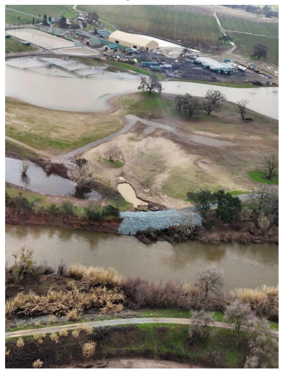
Figure 1 - impact of the storms on Reclamation District (RD) 800 levees and surrounding farmland.

A picture is worth a thousand words, as they say, and I know the memory of the recent storms and floods are in all of our mind's eye as we pursue relief and support one another. As the storms have relented in recent days, local, state, and federal officials joined first responders and other stakeholders in Wilton on January 18, 2023 to tour the impact of the storms on Reclamation District (RD) 800 levees and surrounding farmland.