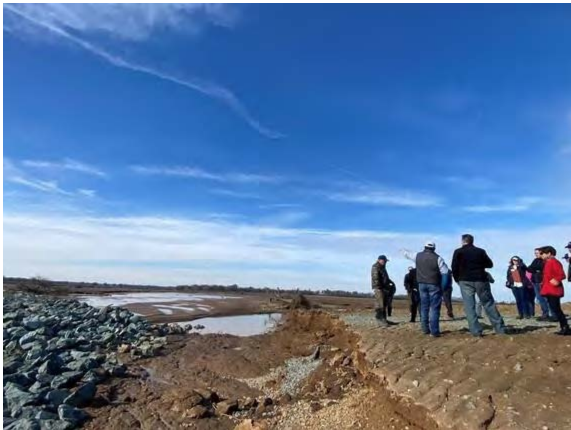
On January 18th, I joined local, state and federal officials, first responders and other stakeholders in Wilton to tour the impact of the winter storms on Reclamation District (RD) 800 levees and surrounding farmland.

Given the New Year's Eve storm and the immense rain and flooding that wreaked havoc across District 5 and our entire region, I was able to secure $300k to dedicate expert Water Resources staff to support the hard work of local stakeholders who have come together to address the flood response needs of the Cosumnes River watershed all the way through to the Sacramento River Delta. Our Water Resource staff will work with local community leaders to manage flood mitigation efforts, including coordination of our multi-benefit Cosumnes River watershed management project. This effort should result in less possibility of disaster, better capture for groundwater recharge, some habitat restoration and lessening of the impacts to the fragile Delta.