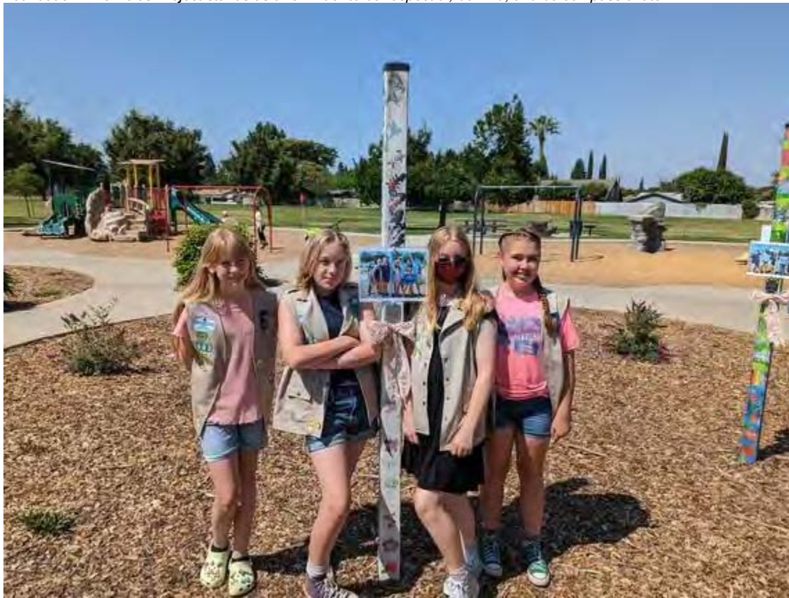
Girl Scout Troop 1363 stands next to their Community Pole at the Rosemont Community Park Butterfly Garden.