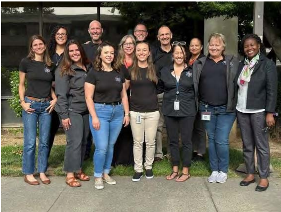
May 21-27 marked EMS week in Sacramento County, which honored our brave EMS workers. The county's EMS Agency is a small, but mighty team.

I was successful in securing nearly $200k in this year's budget to dedicate staff capacity to pursuing innovative community health strategies such as Mobile Integrated Health to further maximize the capacity of our first responders on ambulances, in hospitals and emergency departments and in our psychiatric and other treatment facilities. I look forward to continuing to explore alternative destinations to help our first responders ensure all of us have access to critical care, wherever that can best be provided.