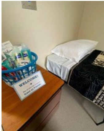
Nottoli Place Room area