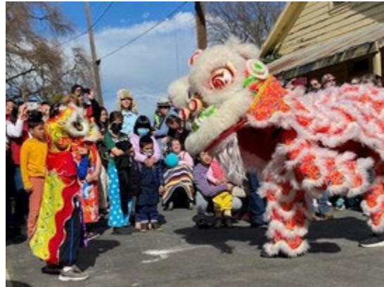
Eastern Ways Martial Arts Lion dancers.