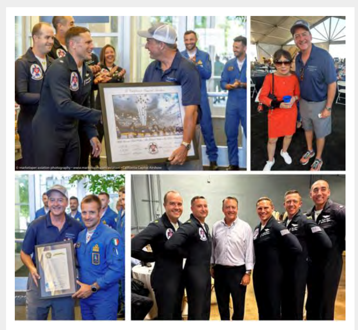
The CA Capital Airshow was awesome! Top left photo: meeting the pilots of the U.S. Air Force Thunderbirds. Top right photo: Congresswoman Doris Matsui. Bottom left photo: presenting a proclamation to the pilots of the Italian Air Force Frecce Tricolori Team. Bottom right photo: Standing with the pilots of the U.S. Air Force Thunderbirds.