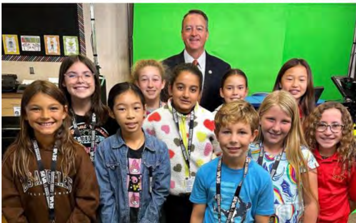
Touring Sunrise Elementary School's television studio in Rancho Cordova. (I even got to be part of the broadcast!)