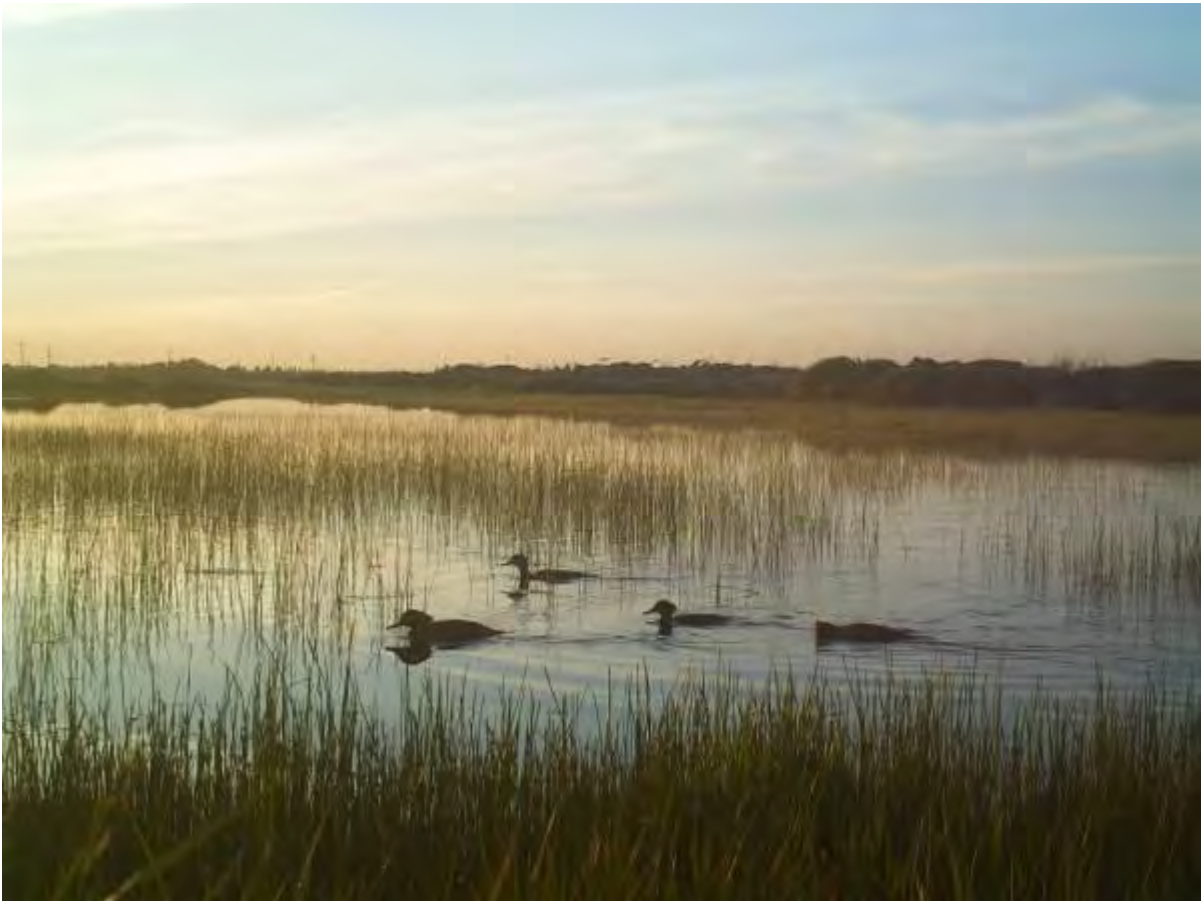
The Red Breasted Merganser at the Illa M. Collin Conservation Preserve.