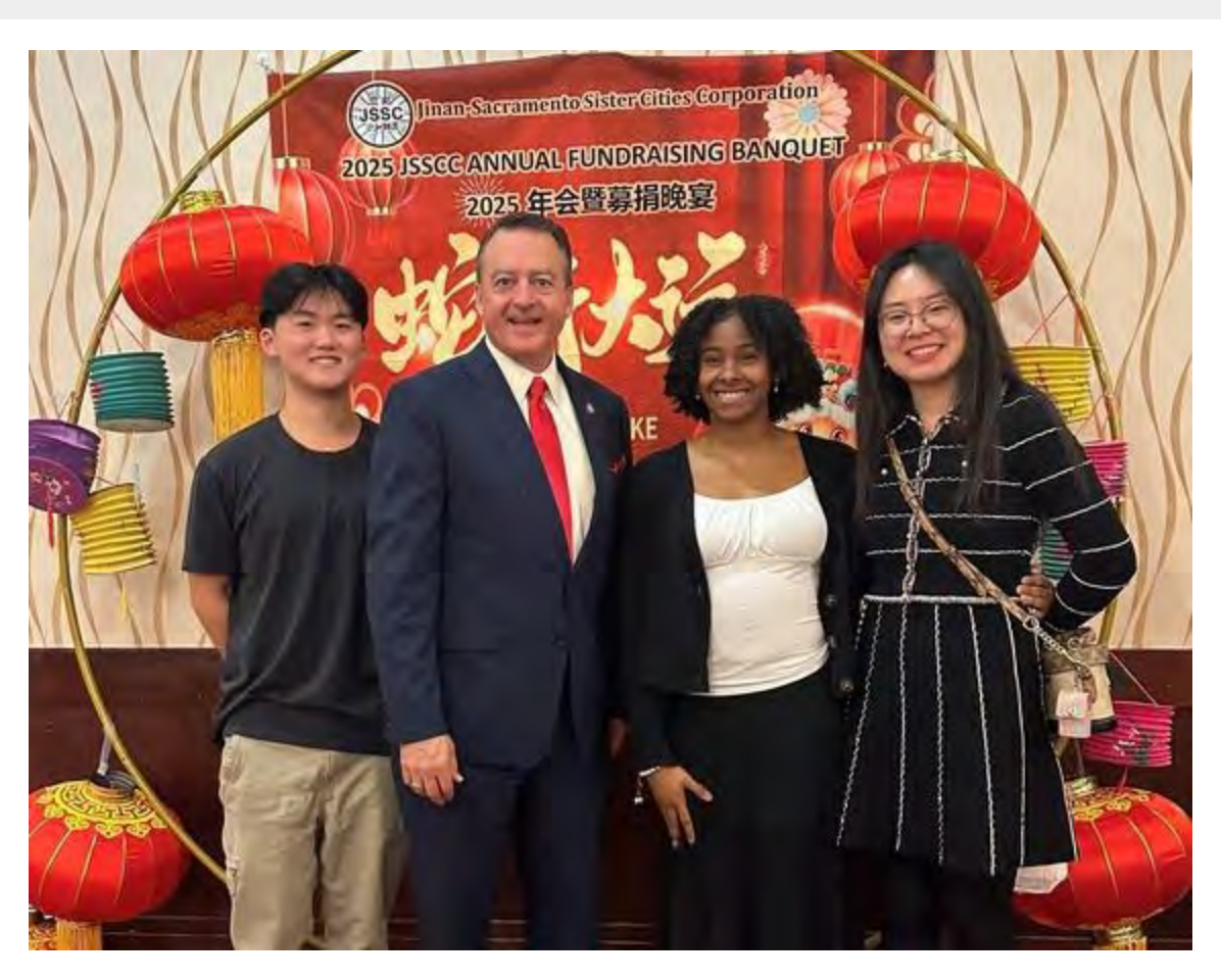
Meeting the Youth Ambassador representatives at the Jinan-Sacramento Sister Cities Corporation fundraising dinner.