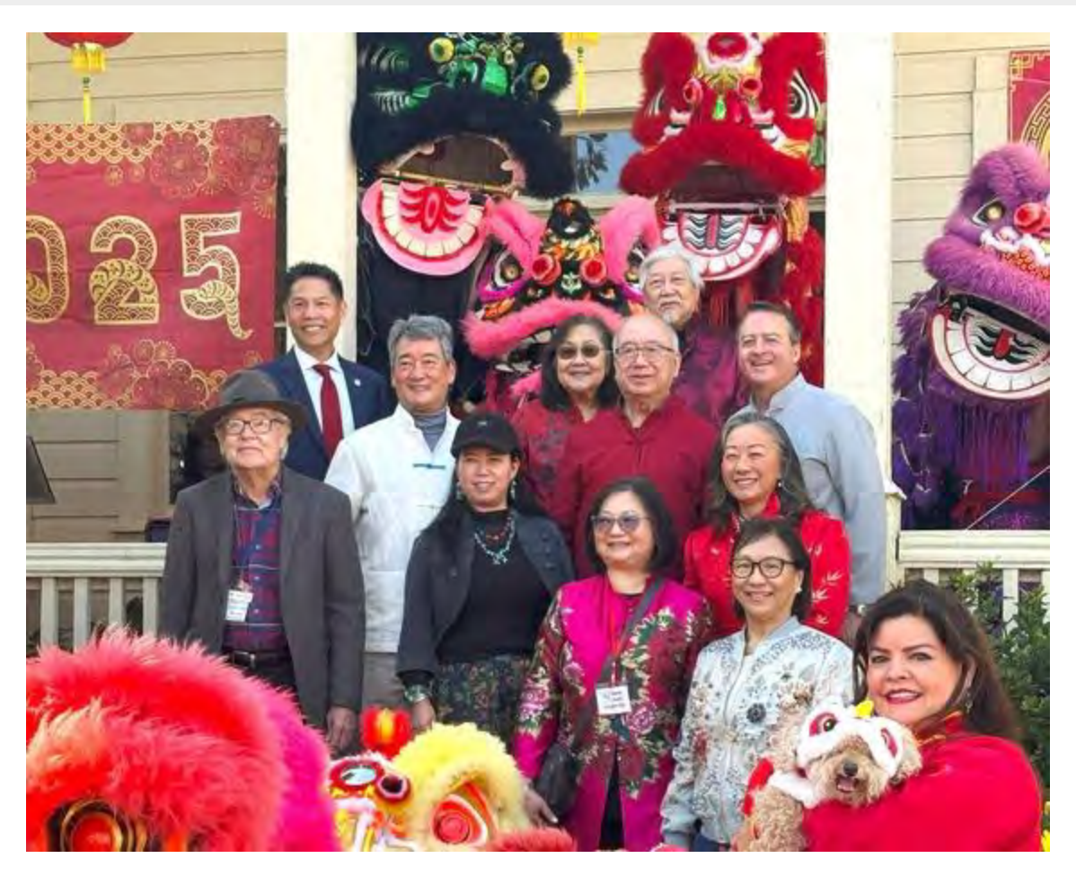
Celebrating Chinese New Year with the Locke Foundation in the historic town of Locke.