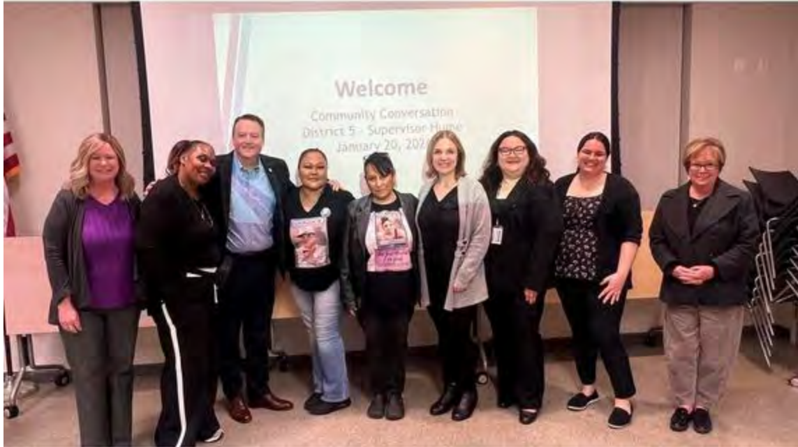
Speaking at the County's Behavioral Health Community Conversation in Elk Grove.