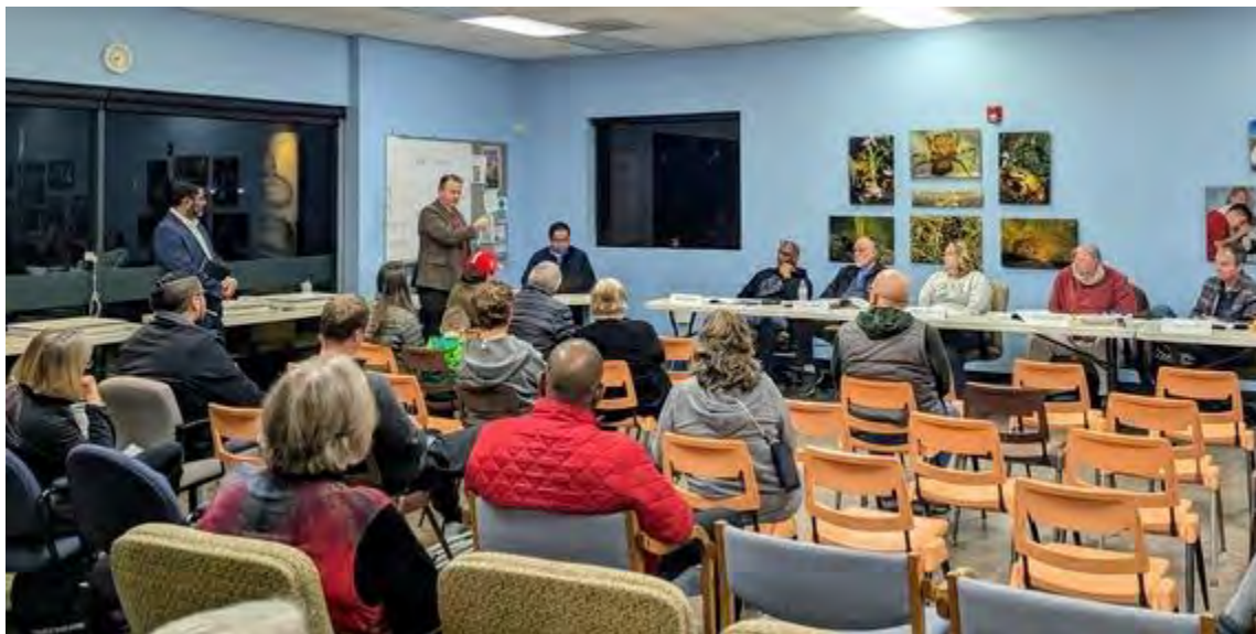
Speaking at the Independence at Mather Owner's Association meeting.